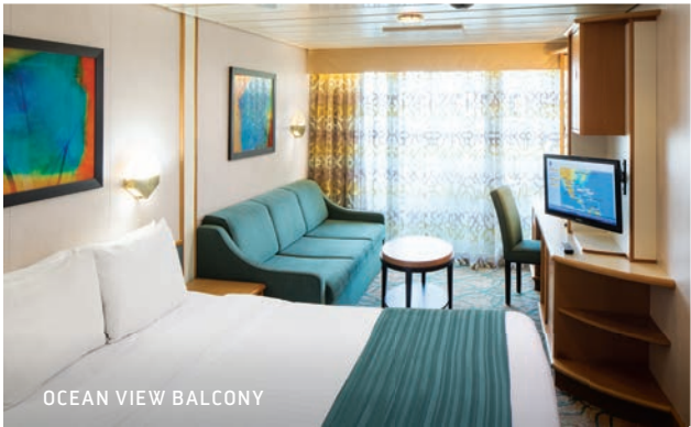
OCEAN VIEW BALCONY