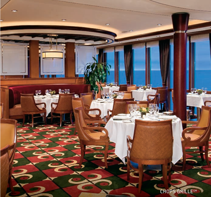
CHOPS GRILLE SM