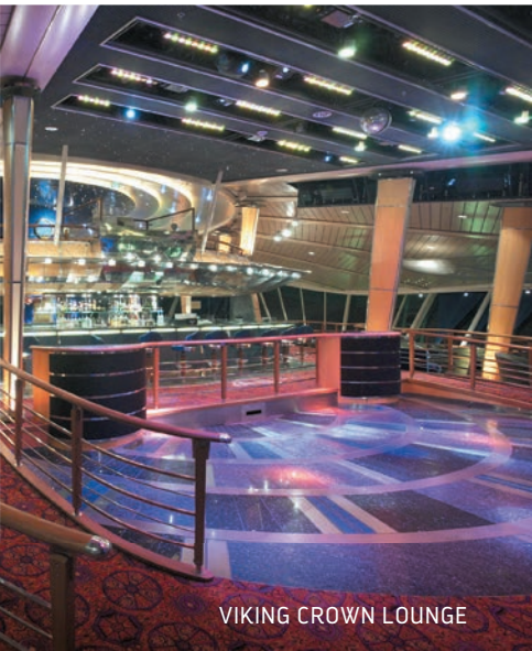
VIKING CROWN LOUNGE