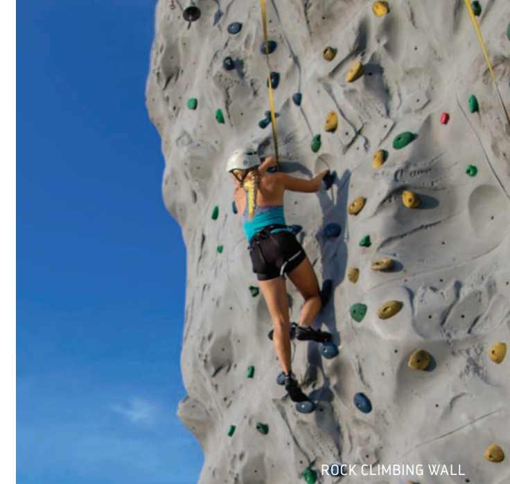
ROCK CLIMBING WALL

Casino Royale SM — Lady Luck awaits at slots, tables and tournaments