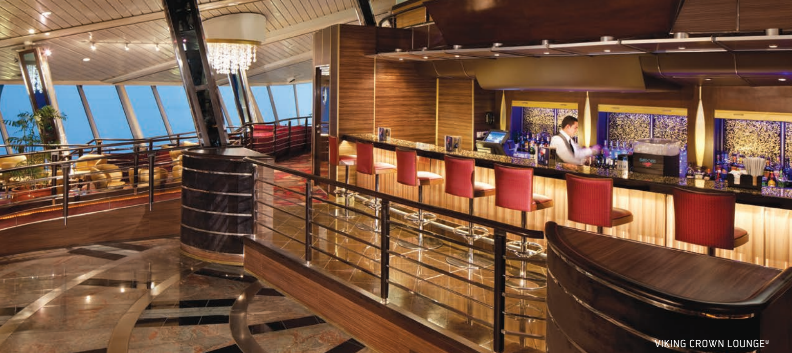
VIKING CROWN LOUNGE®