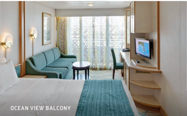
OCEAN VIEW BALCONY