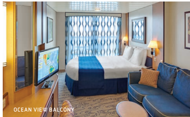
OCEAN VIEW BALCONY