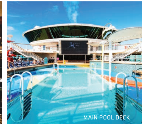
MAIN POOL DECK