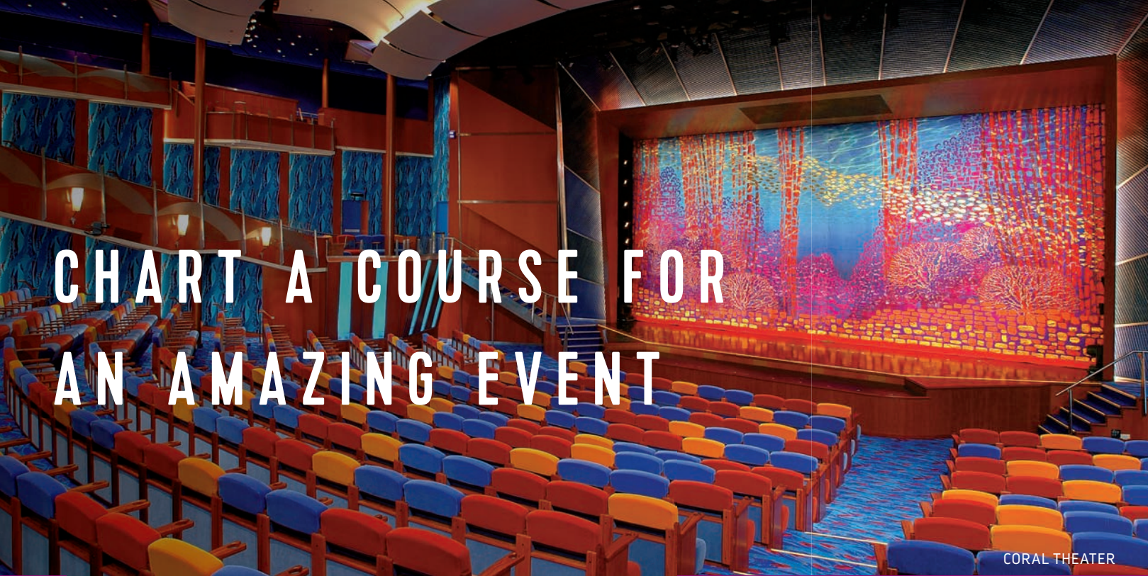
CHART A COURSE FOR AN AMAZING EVENT