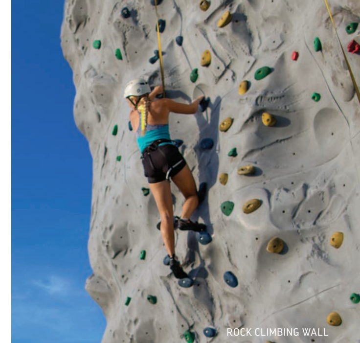
ROCK CLIMBING WALL

Views and Cues — Enjoy panoramic views in the Viking Crown Lounge®, or stop at The Safari Club for self-leveling pool tables