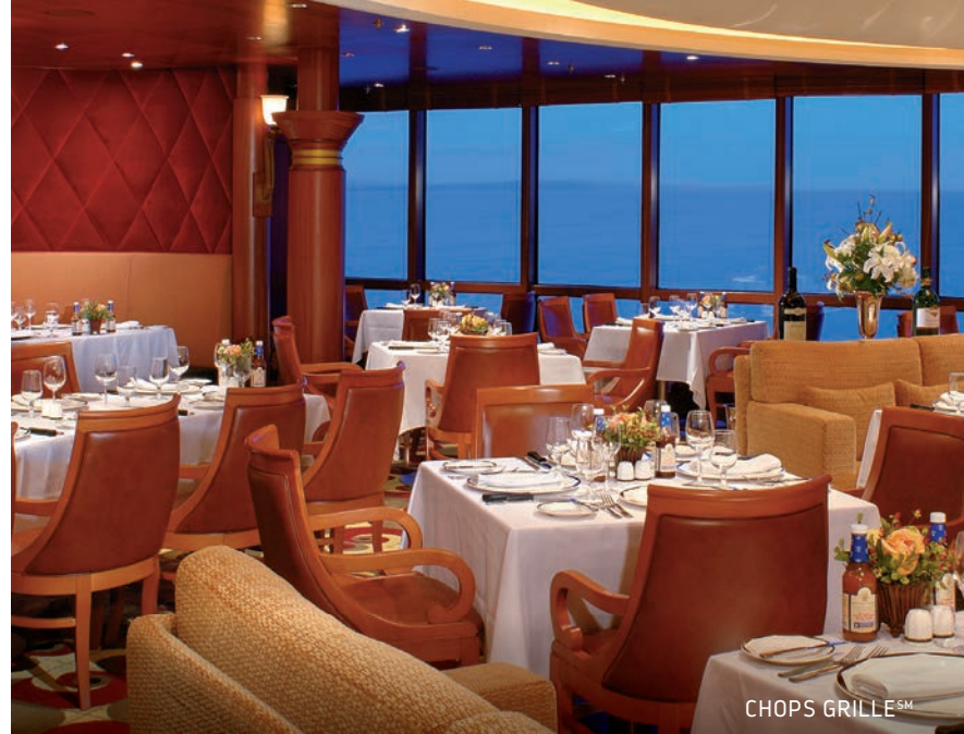
CHOPS GRILLE SM